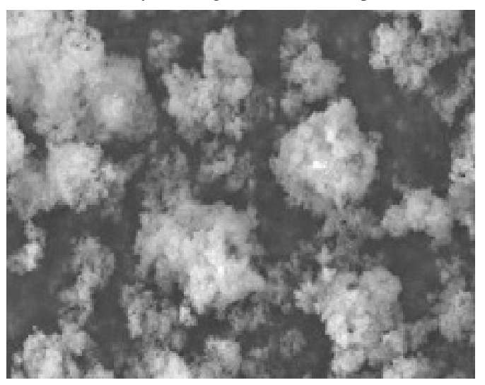
Fig. 1: Scanning electron microscopy of Nanomiemgel.

This study discusses the strategies on sample preparation to acquire images with sufficient quality for size characterization by scanning electron microscope (SEM).